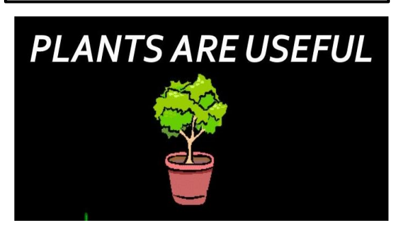
Observe and investigate